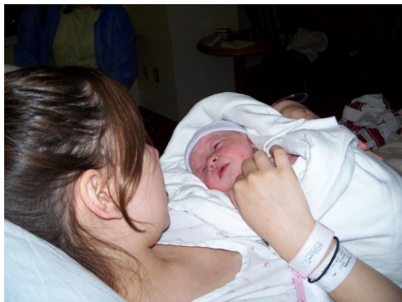
Born February 22, 2007, 8 lbs, 2 ounces, 18 1/2 inches long.