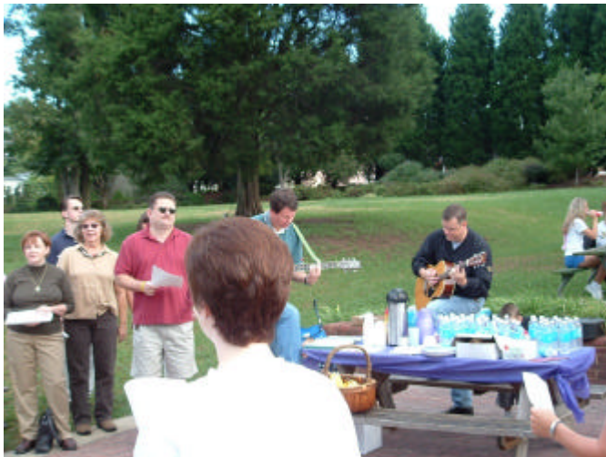
We were grateful that the Matthews United Methodist Church Praise Band came to give us encouragement as we gathered to start our walk.