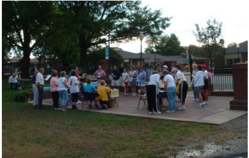
The group gathers for a prayer-filled send-off.